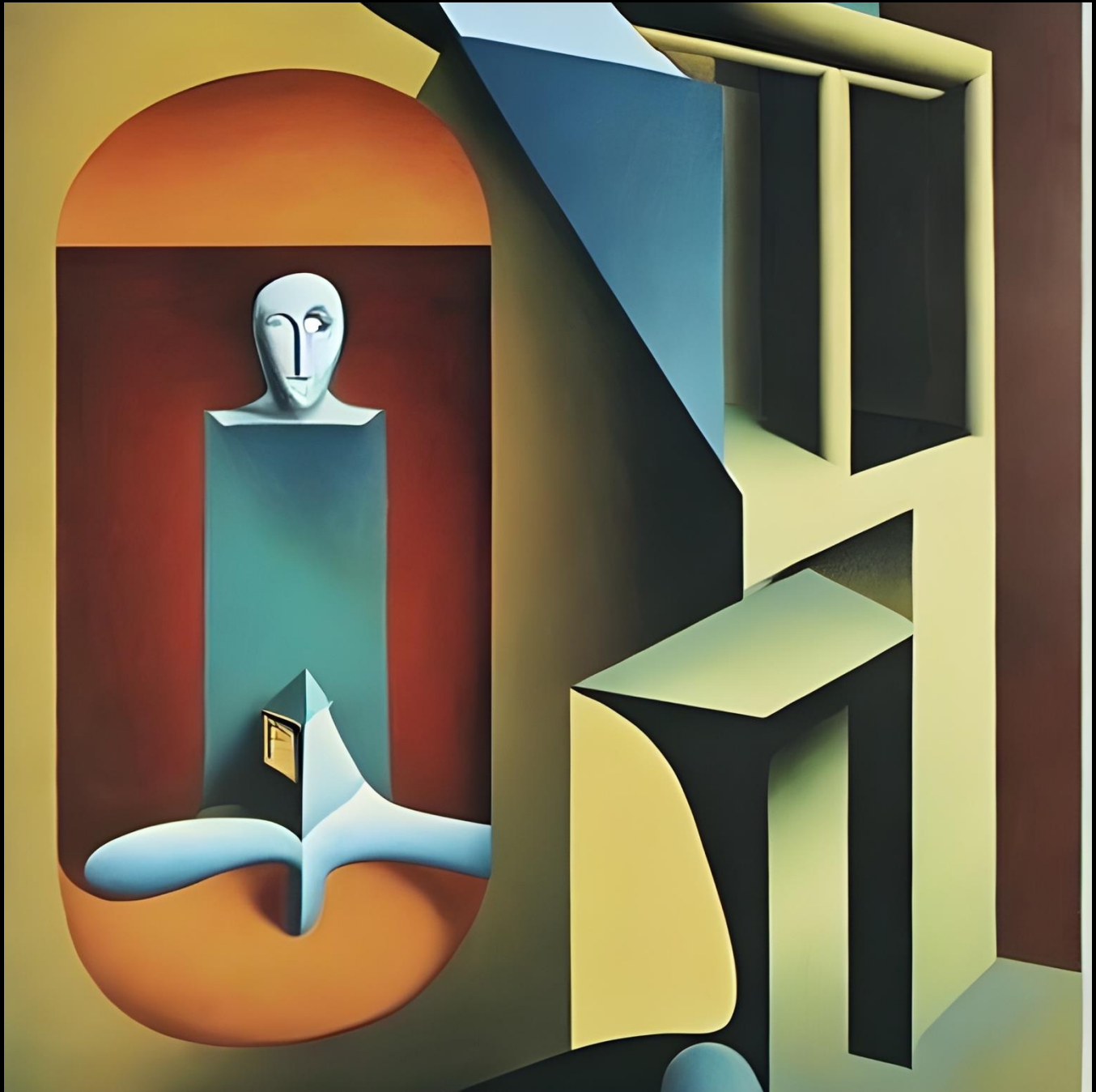
The Self in Consciousness is imposed upon Self in Unconsciousness.