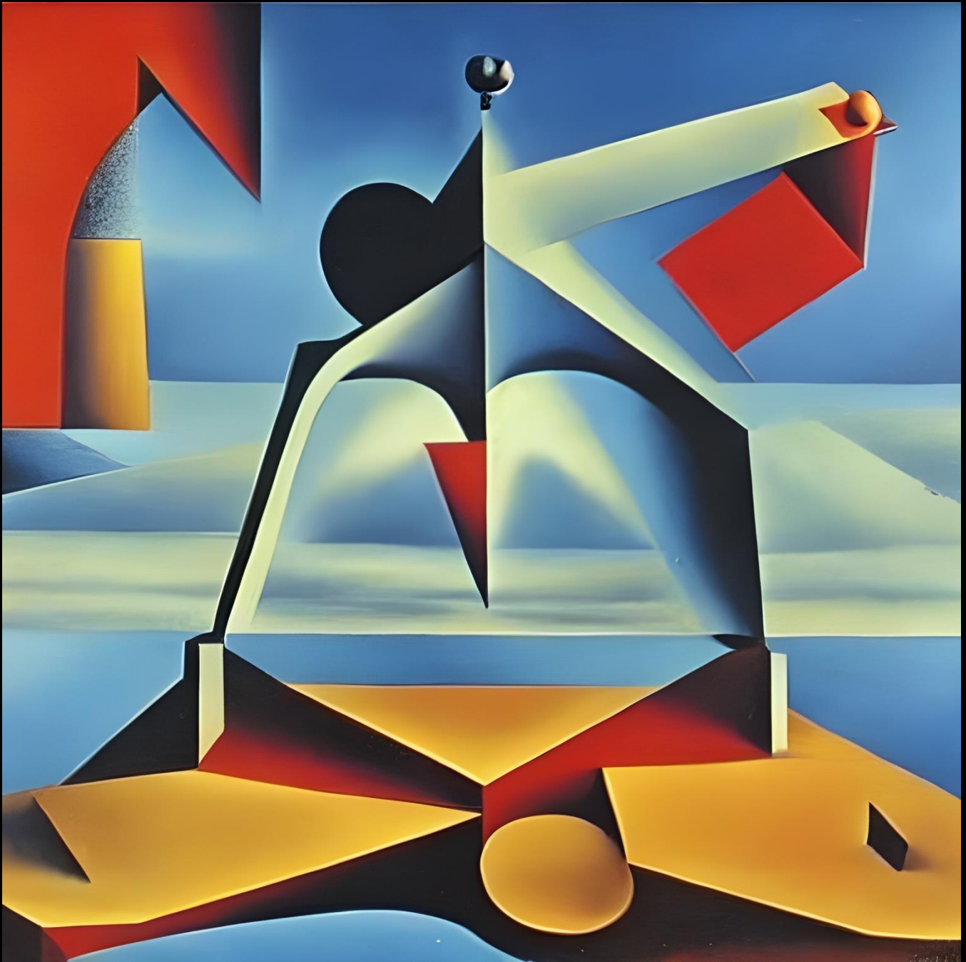
History of Desire Wednesday 29 March, 2023